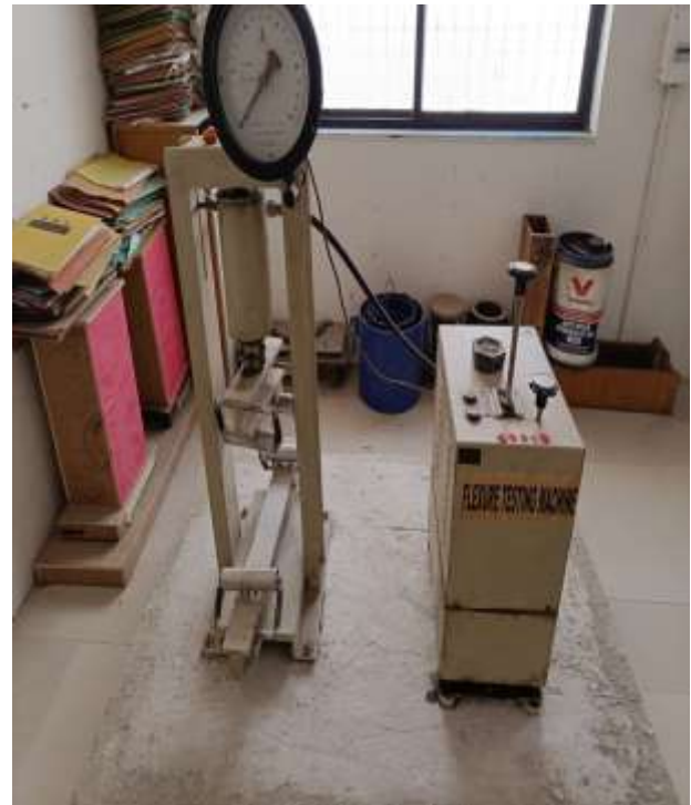
Fig. 1. Flexural Testing Machine

All specimen beams size 700mm × 150mm × 150mm will casted with optimum compressive strength for the specific mix in single lift and consolidated using tamping rods. After final setting of cubes, the cube moulds will be removed and cubes will keptin water tank for curing up to 7 and 28days.